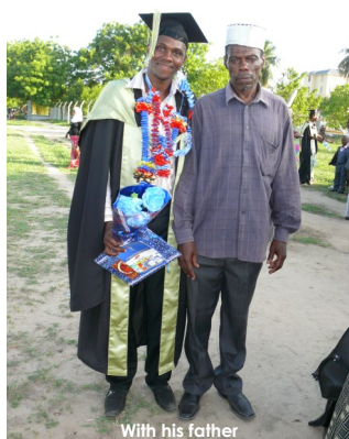
With his father