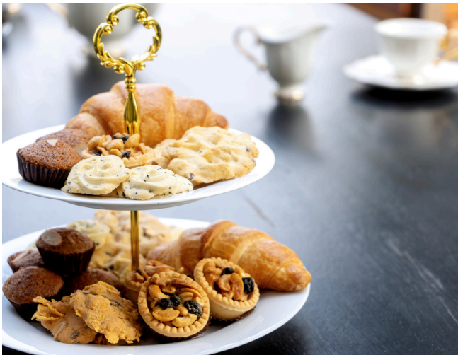
High Tea - R285 per person

Pre-booking is essential. Visit reception or email us at events@305guesthouse.co.za to reserve your package today!