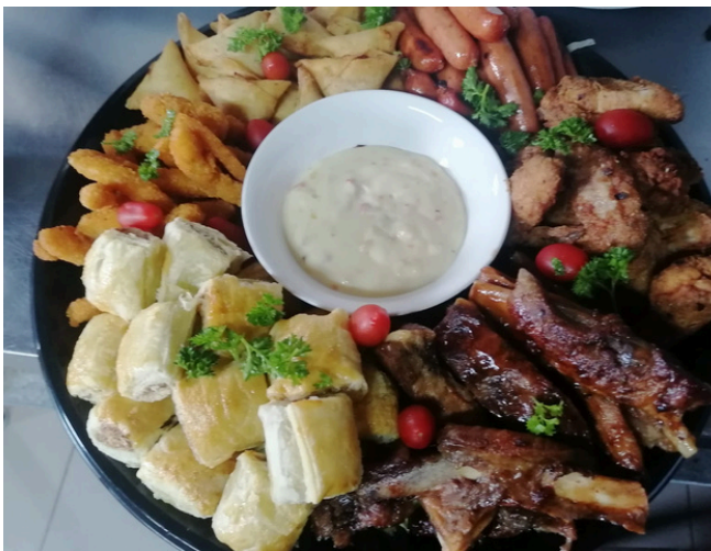
Platters - R500 (serves 10)

Let the little ones enjoy an unforgettable celebration. Includes a delicious main meal, a drink, and a delightful ice-cream treat.