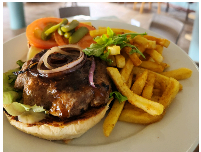
2-Course Menu for Special Occasions R150 - R285 per meal

Ideal for any gathering, our delicious platters are sure to satisfy all your guests.