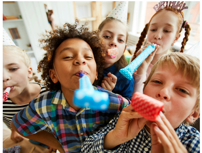
Kiddies Party - R120 per child

Indulge in a sophisticated high tea experience with beautifully decorated tables and a delightful selection of treats.