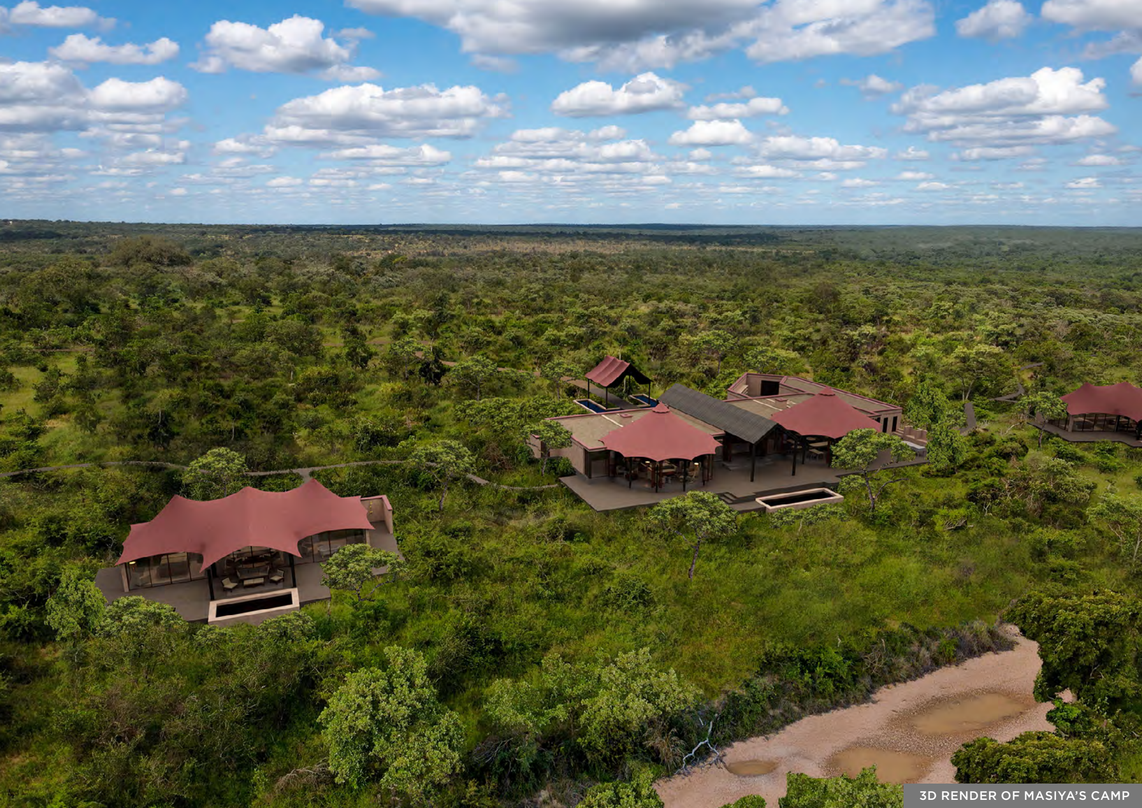
3D RENDER OF MASIYA'S CAMP