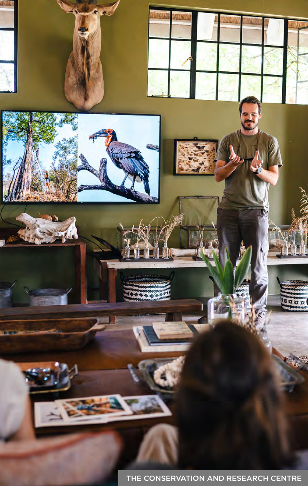
THE CONSERVATION AND RESEARCH CENTRE