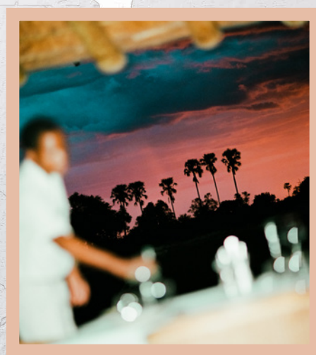
Eagle Island Lodge Botswana

Our two Belmond Safari lodges are set in the unspoilt wilderness of Northern Botswana. This is where the incredible Okavango Delta floods each year, attracting a breathtaking diversity of wildlife.