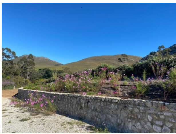
birds and bees in my garden and many sunsets and visitors – not as many sunrises!

The Shalem retreat leadership course in now in its last month. I have a large project to complete. It has been rewarding and energising, and has provided good tools and resources for future retreats. It has been a joy. I still have one retreatant a month, and have a few requests for the rest of the year. I am turning my attention to putting together a formal retreat program for Volmoed. Your prayers are welcome as we hope to partner with people and organisations who fit the vision and mission of Volmoed.