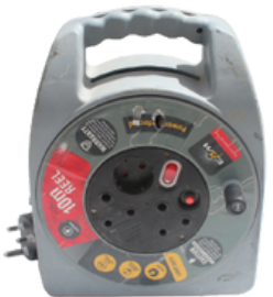
10M EXTENSION REEL