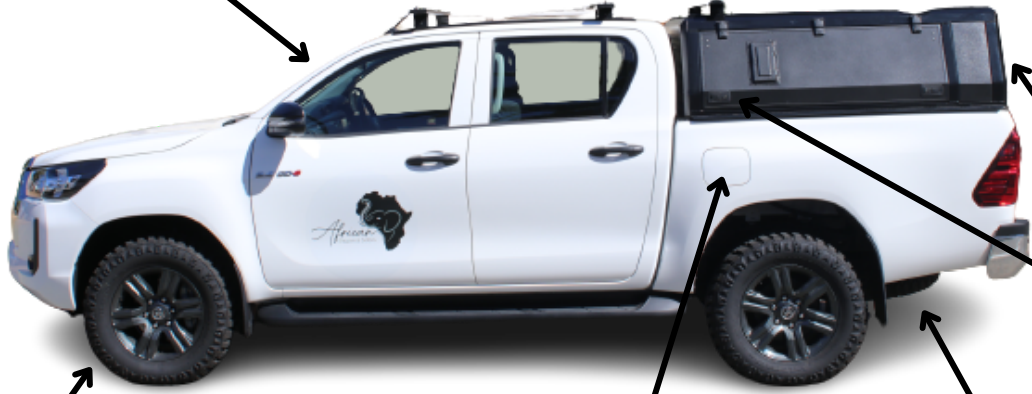
SPECIAL OFFROAD TYRES