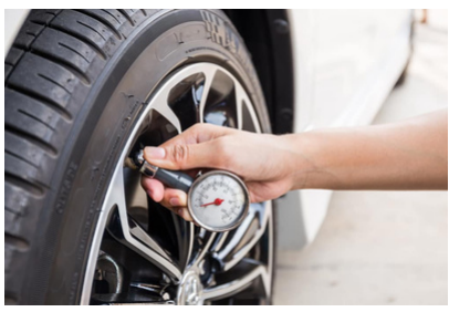
TYRE PRESSURE GAUGE