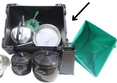
KITCHEN BOX 3