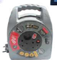
10M EXTENSION REEL