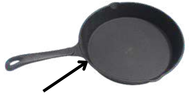
CAST IRON PAN