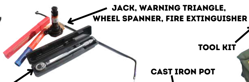
JACK, WARNING TRIANGLE, WHEEL SPANNER, FIRE EXTINGUISHER