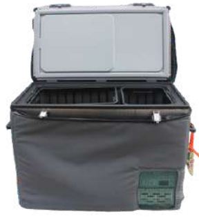
40L FRIDGE/FREEZER FOR 12 & 220V, WITH DOUBLE BATTERY SYSTEM