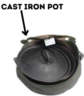
CAST IRON POT