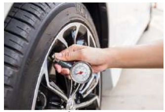
TYRE PRESSURE GAUGE