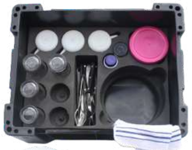
KITCHEN BOX 1