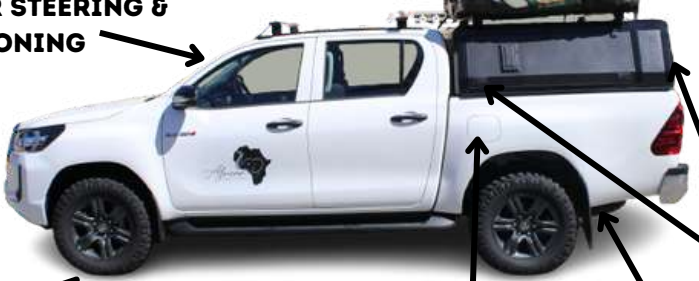
USB RADIO, POWER STEERING & AIRCONDITIONING