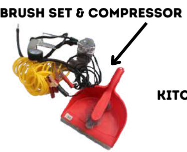
BRUSH SET & COMPRESSOR