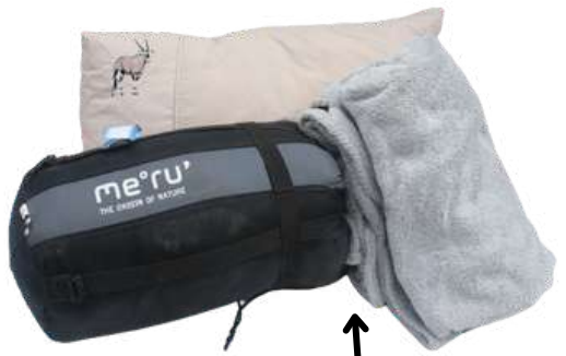
SLEEPING BAG, PILLOW & EXTRA BLANKET