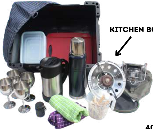
KITCHEN BOX 2