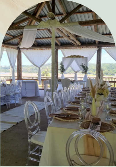
SPARKLING WINE PACKAGE