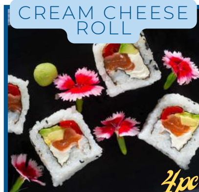
CREAM CHEESE ROLL

PANKO PRAWN, AVO, CUCUMBER AND SWEET CHILLI SAUCE 80