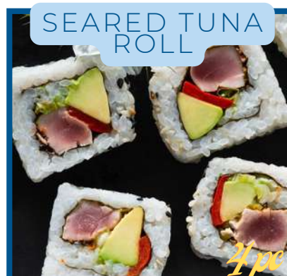
SEARED TUNA ROLL

RAINBOW ROLL WITH SWEET SOYA, SPRING ONION, 7 SPICE, KEWPIE MAYO & CAVIAR 110