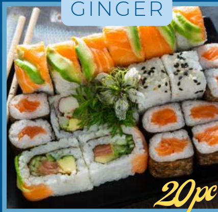
SALMON MAKI, SALMON RAINBOW, CRAB CALIFORNIA 305