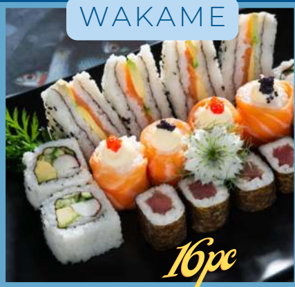
SALMON FASHION, SALMON ROSES, CRAB CALIFORNIA, TUNA MAKI 285