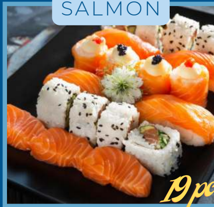
SALMON CALIFORNIA, SALMON ROSES, SALMON SASHIMI, SALMON NIGIRI 525