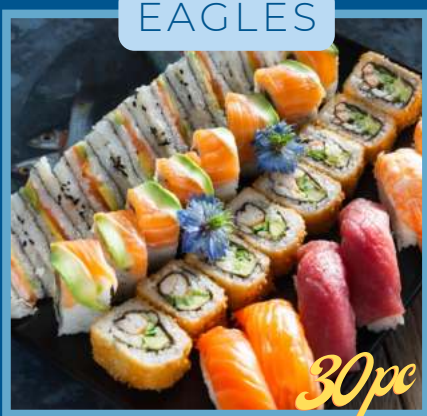
SALMON FASHION, RAINBOW ROLLS, CRISPY PRAWN CALIFORNIA, SALMON NIGIRI, TUNA NIGIRI & PRAWN NIGIRI 615