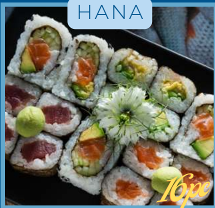
SALMON MAKI, TUNA MAKI, AVO MAKI, SALMON CALIFORNIA 205