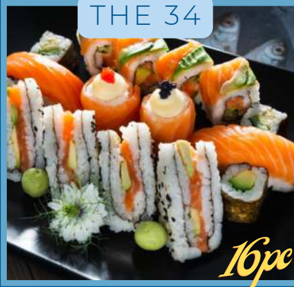
AVOCADO MAKI, SALMON FASHION, SALMON NIGIRI, SALMON ROSE, SALMON RAINBOW 310