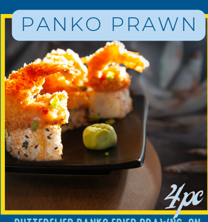
BUTTERFLIED PANKO FRIED PRAWŃS, ON Salmon California & Sweet Chilli Mayo 170