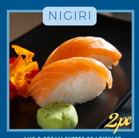
AVO & CREAM CHEESE 60 I PICKLED PEPPERS & CREAM CHEESE 60 I PRAWN 60 I TUNA 60 I SALMON 70 I INARI PRAWN 90