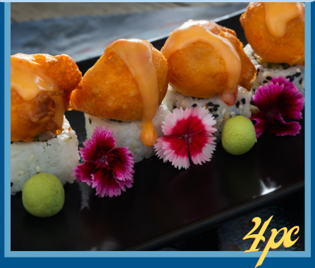
CALIFORNIA ROLL, TOPPED WITH CREAMY SHRIMP TEMPURA. SPICY SALMON OR TUNA 105