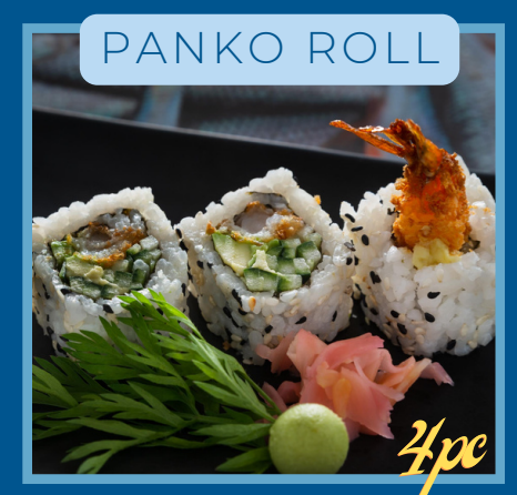
PANKO PRAWN, AVO, CUCUMBER AND SWEET CHILLI SAUCE 72