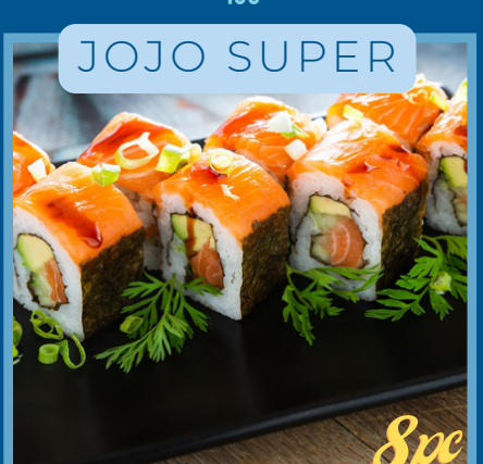
RAINBOW ROLL, WITH SWEET SOYA, SPRING ONION, 7 SPICE, KEWPIE MAYO & CAVIAR 175