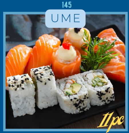
SALMON SASHIMI, SALMON NIGIRI, SALMON Roses, Prawn California 315