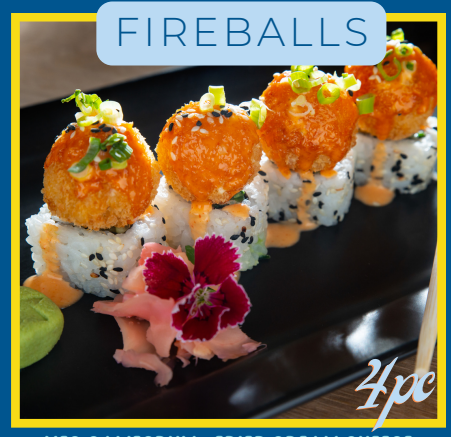
VEG CALIFORNIA, FRIED CREAM CHÉESE BALLS & FIRE SAUCE VEGETARIAN 145 I SMOKED SALMON 195