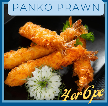
SERVED WITH SWEET CHILLI SAUCE 4 PC = 75 6 PC = 105