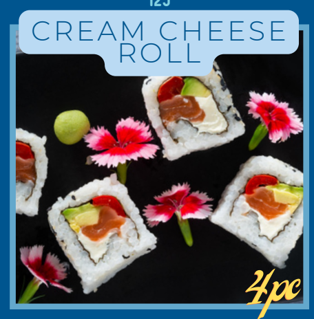
AVO, CREAM CHEESE & PEPPADEW. CHOOSE SALMON, PRAWN OR SMOKED SALMON 85