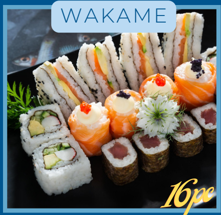
SALMON FASHION, SALMON ROSES, ĆRAN California, avo maki 285