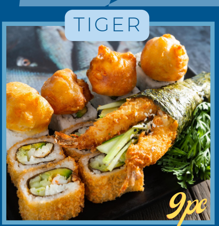
SGRIMP TEMPURA, PRAWN HANDROLL. CRISPY TUNA CALIFORNIA 245