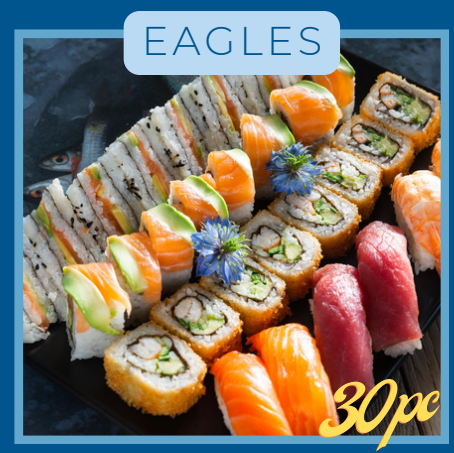
SALMON FASHION & RAINBOW, CRISPY PRAWN CALIFORNIA, SALMON & TUNA & PRAWN NIGIRI 615