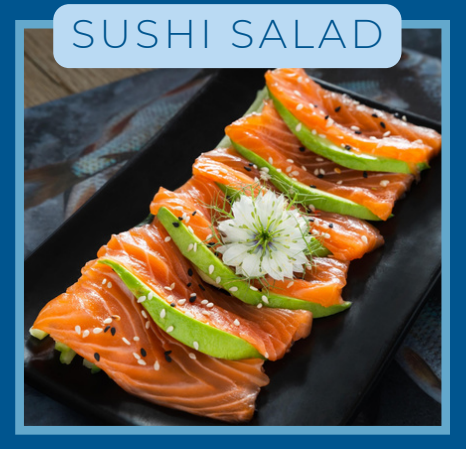
THIN SLICES OF FRESH FISH AND AVO. SERVED WITH SWEET CHILLI SAUCE SALMON 195 I TUNA 185