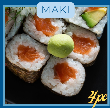
CUCUMBER 35 I AVOCADO 40 I CRAB 40 I SMOKED SALMON 55 I PRAWN 50 I TUNA 50 I SALMON 60 I PANKO PRAWN 55