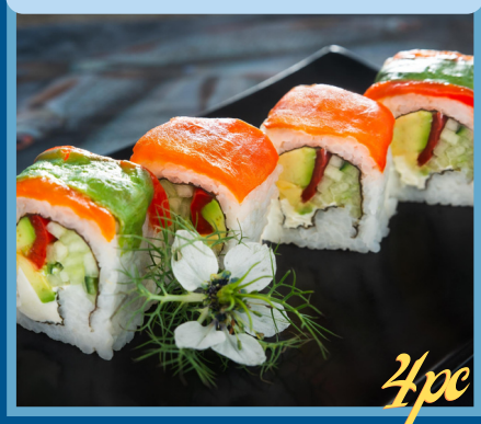
PINK: SALMON & AVO 80 GREEN: ROCKET & AVO 55 RED: PEPPADEW, CREAM CHEESE, AVO 70