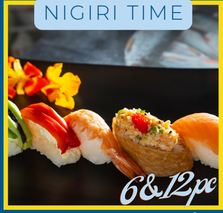
A TASTE THROUGH ALL OUR NIGIRI'S 6-PIECE: 195 | 12-PIECE: 355

SALMON FASHION, SALMON NIGIRI, PRAWN NIGIRI, TUNA NIGIRI, SALMON ROSES, TUNA SASHIMI, SALMON SASHIMI, CRISPY CRAB CALIFORNIA, SALMON CALIFORNIA, TUNA MAKI, RAINBOW SANDWICHES, INARI PRAWN 1250