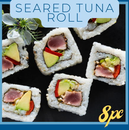
SEARED TUNA, AVO, CREAM CHEESE AND PEPPADEW 125