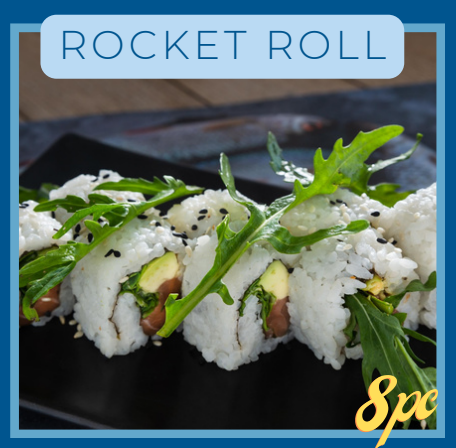
SALMON, ROCKET AND AVO, TOPPED WITH ROCKET AND KEWPIE MAYO 125