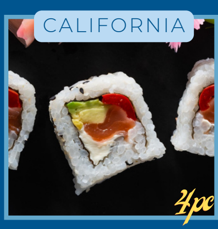
VEGETARIAN 45 I CRAB 50 I SMOKED SALMON 72 I PRAWN 65 I SPICY SALMON 72 I SPICY TUNA 72 TUNA 65 I SALMON 70 I PANKO PRAWN 55