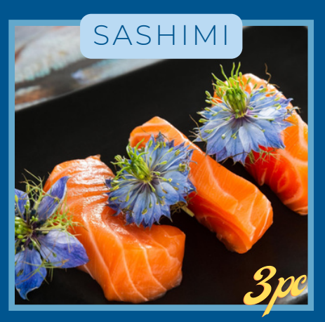
TUNA 90 I SEARED TUNA 95 I SALMON 120 I SEARED SALMON 125