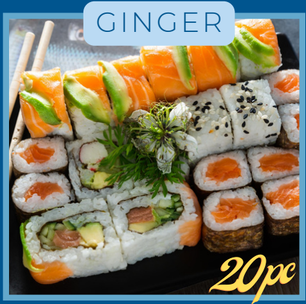
SALMON MAKI, SALMON RAINBOW, CRAB California 305