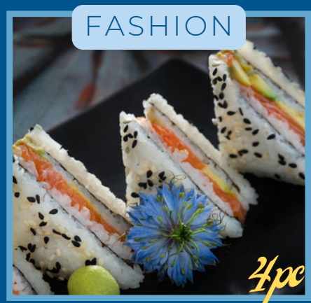
VEGETARIAN 45 I CRAB 50 I SMOKED Salmon 80 I Prawn 65 I Tuna 65 I Salmon 75