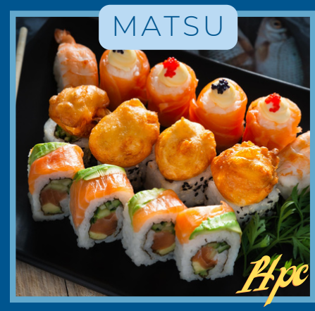
SHRIMP TEMPURA. PRAWN NIGIRI, SALMON ROSE. SALMON RAINBOW 380