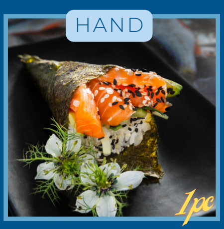
AVO & CUCUMBER 60 | CRAB 65 | PANKO PRAWN 80 | PRAWN 80 | TUNA 80 | SALMON 90