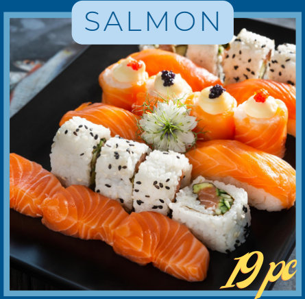
SALMON CALIFORNIA, SALMON ROSES, Salmon Sashimi, Salmon Nigiri 525