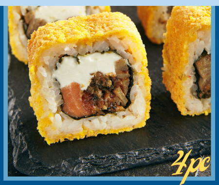
PANKO PRAWN, AVO & CUCUMBER, TOPPED WITH SWEET CHILLI SAUCE & KEWPIE MAYO 85