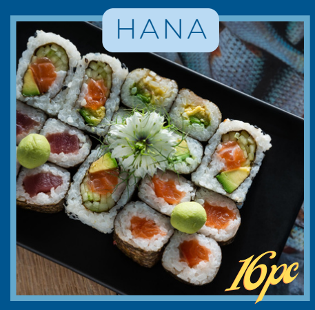
SALMON MAKI, TUNA MAKI, AVO MAKI, Salmon California 205