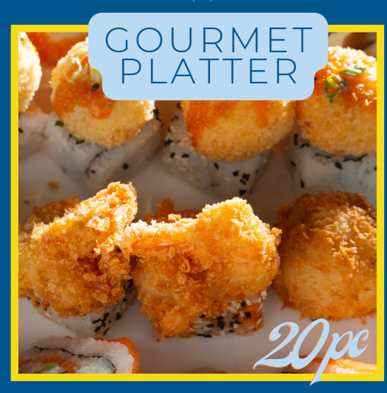
PRAWN BITES, SMOKED SALMON FIREBALLS, VEGETARIAN FIREBALLS, PANKO PRAWN ROLLS, PICKLED PEPPER NIGIRI, AVO & CREAM CHEESE NIGIRI 825