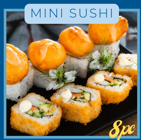
CRISPY PRAWN CALIFORNIA ÷ SHRIMP Tempura 170