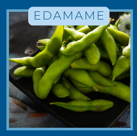
GREEN SOY BEANS, STEAMED SERVED WITH SWEET CHILLI SAUCE AND COARSE SALT