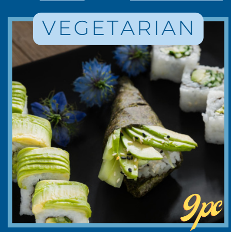
VEGETARIAN CALIFORNIA. GREEN RAINBOW. AVO & CUCUMBER HANDROLL