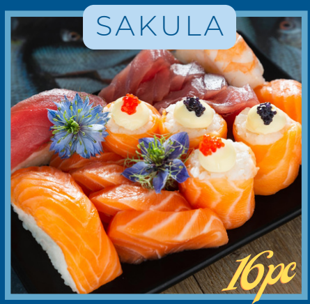
TUNA SASHIMI & NIGIRI, SALMON SAŚHIMI & ROSES & NIGIRI, PRAWN NIGIRI 555