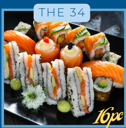
AVOCADO MAKI, SALMON FASHION, SALMON NIGIRI, SLAMON ROSE, SALMON RAINBOW 310