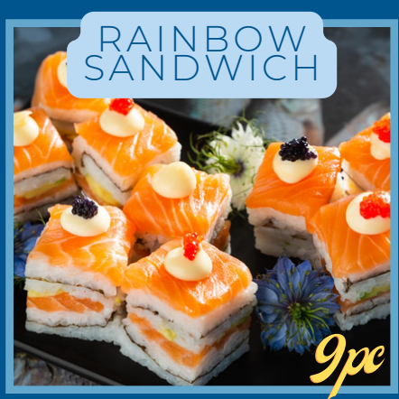
MINI SANDWICHES FILLED AND TOPPÉD WITH SALMON. AVO. MAYO & CAVIAR 220