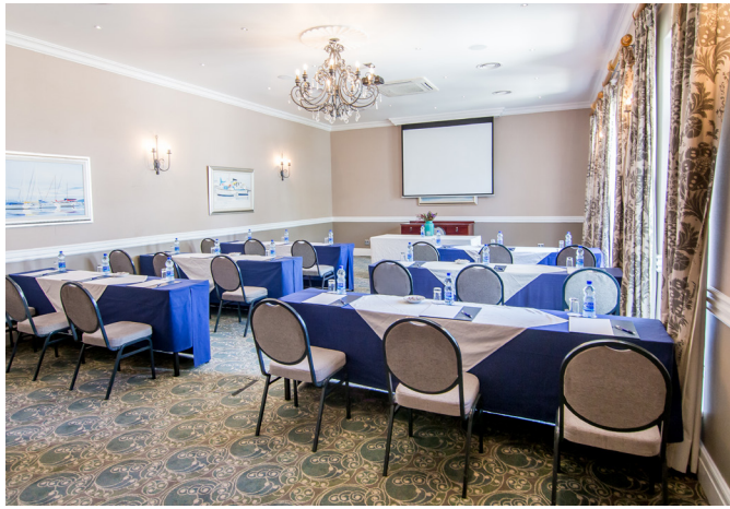
CLASSROOM SET-UP Ideal for large presentations...

ALL CONFERENCING PACKAGES INCLUDE THE USE OF THE VENUE AND THE USE OF STANDARD EQUIPMENT WHICH INCLUDES THE FOLLOWING: