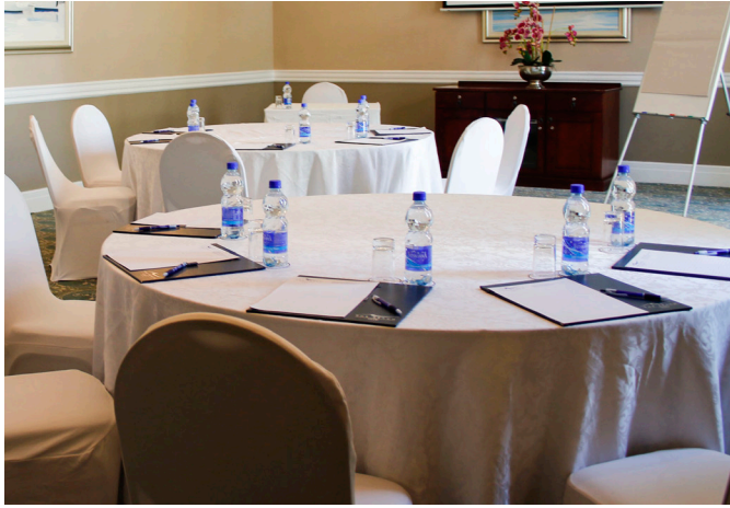
BANQUETING SET-UP Ideal for large product launches...