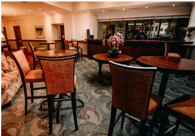
THE CONFERENCE BAR Perfect for after conference drinks or cocktail functions...