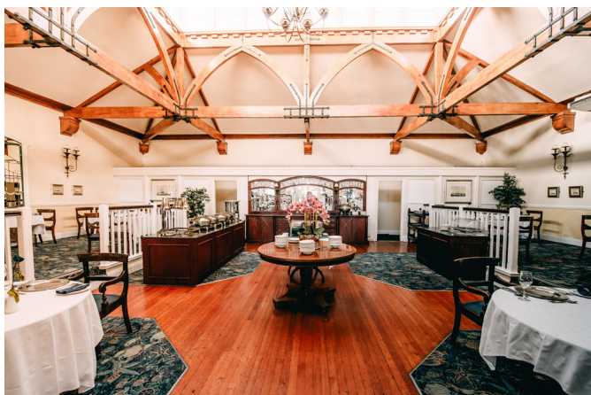
PLATED LUNCH SERVED IN THE CREST RESTAURANT Delectable dishes on offer. Specific requirements can be catered for...