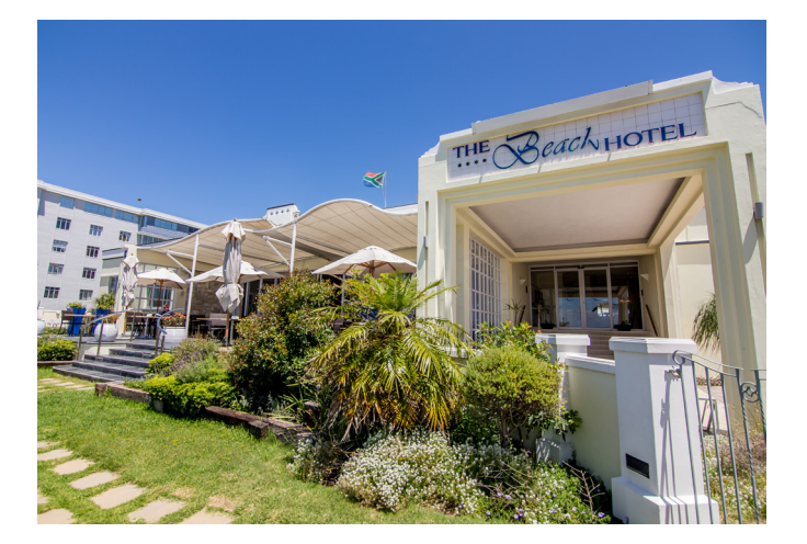
THE BEACH HOTEL ENTRANCE Mixing business with pleasure is easily done at this ideally situated 4 star hotel...

WELCOME TO THE BEACH HOTEL, SUMMERSTRAND, PORT ELIZABETH, THE IDEAL VENUE FOR YOUR CONFERENCES, BOARDROOM MEETINGS, PRODUCT LAUNCHES AND MORE.